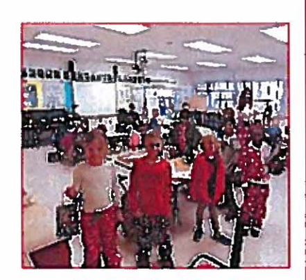
Students from Class 2M on Pajama Day!

week, we had Pajama Day, which was to help raise awareness about families who are in need of sleepwear during these cold winter months. The Student Council came up with the theme - Wear a Pair, Donate a Pair, to kick off our week-long PJ drive! All collected items will be donated to the Pajama Program in New York City. Earlier this month, Student Ambassadors created handmade holiday cards for children who are hospitalized in our area. The SA's absolutely loved creating the cards and are thrilled for the children to receive them! Our "Secret Snowman" activity will take place next week. Homerooms will be given clues by a secret staff member and on Friday afternoon, classes will make their guesses. The "reveal" will be done live on a special broadcast of LHTV News at 2:30! This is in lieu of our school-wide winter sing-a-long, since the gymnasium will be under construction for part of next week. (We are looking forward to a new floor when we return from break). As you may have noticed, our district website has had some recent enhancements. Please take a look on the Lloyd Harbor School Page for additions, stories and pictures!